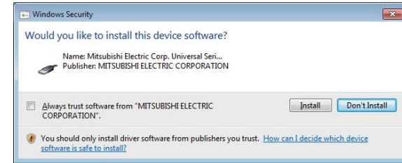
Screen when Microsoft® Windows® 7 Professional is used