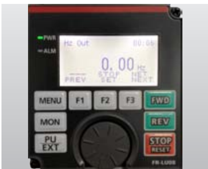
FR-LU08 as full text display with up to fifteen language and real time clock.

The operation panel with the one touch Digital Dial allows direct access to all important parameters. Select the operation panel ideal for your needs. Choose either a LU operation panel with an LCD screen offering enhanced display functionality and a clock function, or a more economical DU operation panel with a 5-digit, 12-segment display.