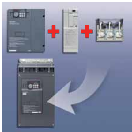
Integration of three functions in a single unit significantly reduces space requirements

The integration of the frequency inverter and power regeneration system in a single unit reduces space requirements, making installation in the switchgear cabinet much simpler.