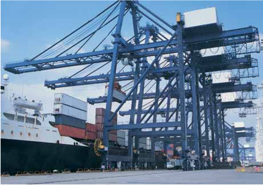
The new FR-A741 can save a lot of power in applications suitable for regenerative braking

The new FR-A741 both reduces your initial investment outlay and keeps operating costs low. The integrated power regeneration function makes it possible to use smaller and much less expensive drive systems and enables simpler and more compact switchgear cabinet layouts. The advantages over conventional frequency inverter technology are very significant: