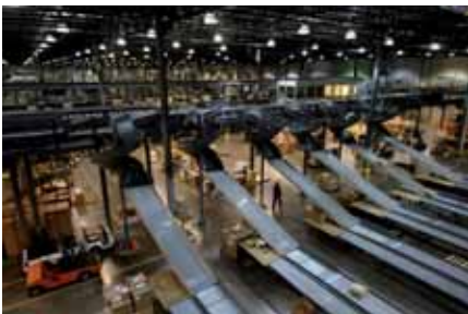
Complex conveyor systems have potential for significant energy savings

But that's not all – the energy fed back into the grid can also be used for other purposes, reducing operating costs still further.