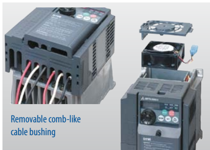
Removable comb-like cable bushing

The fans are designed as compact units that can be replaced in less than 10 seconds for cleaning or in the event of failure.