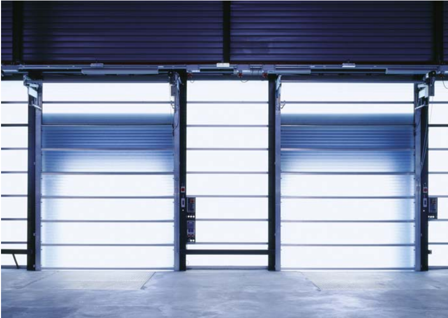
Door and gate drives are only some of the multiple applications of the FR-D700 SC series.