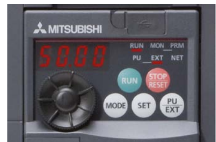
The built-in multi-user panel with Digital Dial

In addition to entering and displaying various parameters, the integrated four-digit LED display also monitors and displays current operating values and alarm messages.