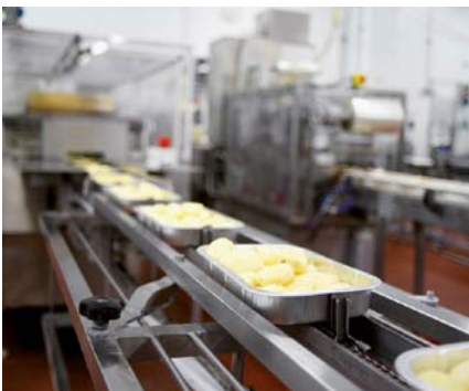
Conveyor belts and chain conveyors are an ideal application for the FR-D700 SC.