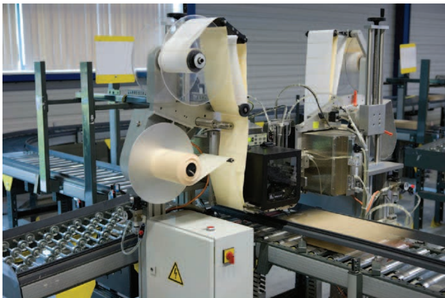
Test modifications without disrupting production

The GT14 is the latest addition to the GOT1000 series of HMIs, and sets new performance benchmarks for mid-range, 5.7" panel mount terminals. Boasting all the functions for which Mitsubishi Electric HMIs have become renowned, at prices which make them one of the most cost-effective on the market, these new operator terminals offer a host of new features and benefits, including an SD card slot, USB ports, Ethernet communications options, a TFT screen capable of displaying 65,536 colours, LED backlighting and analogue touch functionality.