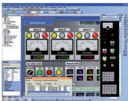
User friendly GT Designer HMI software