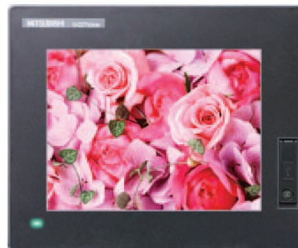
Enjoy the brightness of the GT14 TFT screen with 65536 colours and LED backlight

With internal memory expanded to 9 MB as standard, the GT14 can save up to 2,000 data points, while SD cards and USB memory sticks can provide additional memory for storing or transferring data. In addition, for increased flexibility, the GT14 is able to log data from multiple connected devices such as PLCs and temperature controllers. In addition, with its multi-channel function, a single GT14 can monitor and control up to two channels of factory automation products connected either over Ethernet or serial communications. For example, you could connect a PLC with a servo amplifier to one channel and a frequency inverter or temperature controller to the other, and then alternate between the two to monitor both devices.