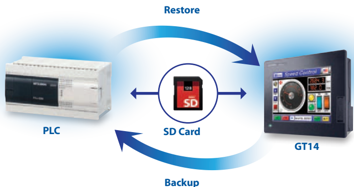
SD cards and USB's provide additional memory

The main component is the intuitive and user-friendly GT Designer HMI software. It comes with a full library of ready-to-use graphics objects and a large number of fonts for building informative and intuitive interface screens. Together with the integrated GT Simulator, it enables you to get your HMI projects up and running without the traditional debugging and fault-finding headaches.