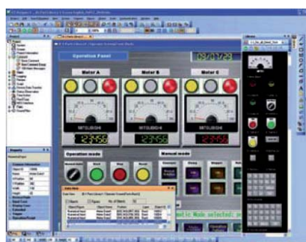
User friendly GT Designer HMI software