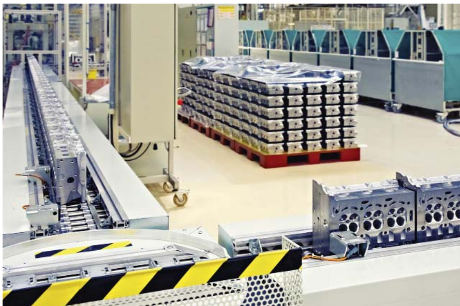
Test modifications without disrupting production

The GT14 is the latest addition to the GOT1000 series of HMIs, and sets new performance benchmarks for mid-range, 5.7" panel mount terminals. Boasting all the functions for which Mitsubishi Electric HMIs have become renowned, at prices which make them one of the most cost-effective on the market, these new operator terminals offer a host of new features and benefits, including an SD card slot, USB ports, Ethernet communications options, a TFT screen capable of displaying 65,536 colours, LED backlighting and analogue touch functionality.