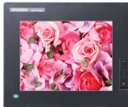
Enjoy the brightness of the GT14 TFT screen with 65536 colours and LED backlight

With internal memory expanded to 9 MB as standard, the GT14 can save up to 2,000 data points, while SD cards and USB memory sticks can provide additional memory for storing or transferring data. In addition, for increased flexibility, the GT14 is able to log data from multiple connected devices such as PLCs and temperature controllers. In addition, with its multi-channel function, a single GT14 can monitor and control up to two channels of factory automation products connected either over Ethernet or serial communications. For example, you could connect a PLC with a servo amplifier to one channel and a frequency inverter or temperature controller to the other, and then alternate between the two to monitor both devices.