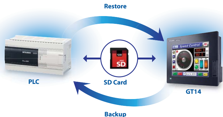
SD cards and USB's provide additional memory

The main component is the intuitive and user-friendly GT Designer HMI software. It comes with a full library of ready-to-use graphics objects and a large number of fonts for building informative and intuitive interface screens. Together with the integrated GT Simulator, it enables you to get your HMI projects up and running without the traditional debugging and fault-finding headaches.