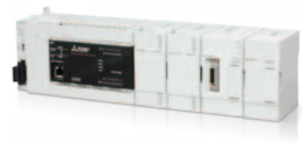
Add-on modules to meet your needs

The FX5U offers a range of troubleshooting functions to speed system set-up, increase system availability and reduce maintenance requirements. Comprehensive debugging functions are included, along with improved diagnostics functions. Simple maintenance is facilitated through improved diagnostics including error history, hardware monitor, SD card for logging & tracing functions, automatic system recognition and several program debugging functions.