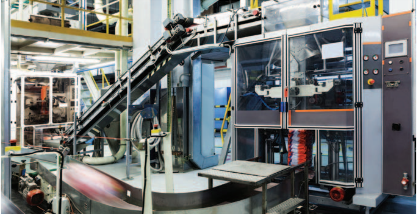
Optimized products for higher production output with less engineering efforts